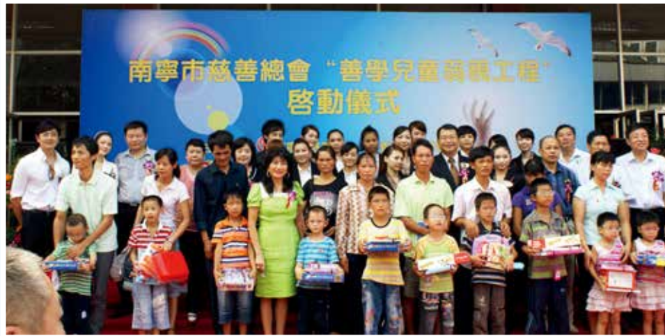
金至尊珠寶贊助機構、南寧市第二人民醫院及受惠兒童等大合照 With our supporting organization 3D-Gold Jewellery, Nanning the Second People's Hospital and the beneficial children.

Over the years, the Foundation collaborates with qualified hospitals and has provided free medical treatment for over 3,000 children in Jiejiang, Chengdu, Inner Mongolia, Harbin, Daqing, Anning, Nanning, Zhongshan, Haikou, Handan and Vietnam. "Sheen Hok Amblyopia Project" is expected to extend to remote areas such as Dali and Jinan, which aims to cure 100 children with Amblyopia in each hospital each year.