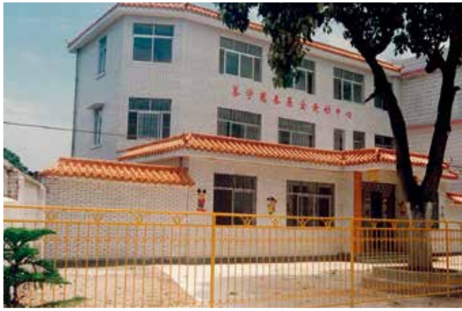
廣東省佛崗縣湯塘鎮 Tangtang Town (Fogang County, Guangdong)