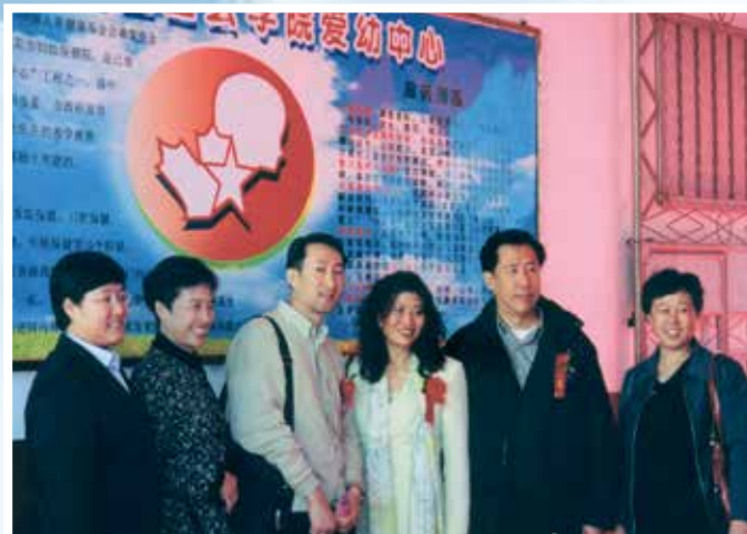
山東省萊陽市 Laiyang City (Shangdong)