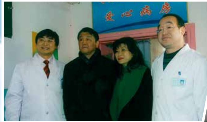
▲ 2012年2月——在內蒙古舉行弱視啟動儀式 Inauguration Ceremony of Sheen Hok Amblyopia Project Inner Mongolia, February 2012.