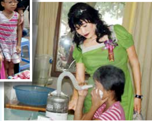
▲ 2010 年 8 月在廣西省南寧市舉行弱視工程啟動儀式 Inauguration Ceremony of Sheen Hok Amblyopia Project Nanning, Guangxi, August 2010.