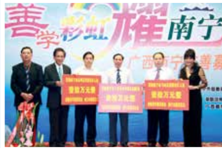
▲ 籌款晚宴得到多位善長人翁鼎力支持 Many patrons and supporters attended the fund raising dinner.