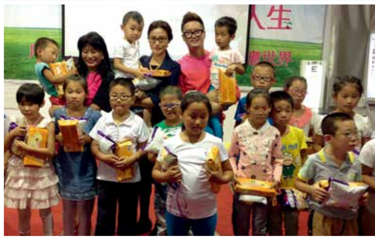
▲ 2014年9月香港善學慈善基金及香港國際眼科基金為內蒙古弱視兒童義診慈善之旅 Sheen Hok Charitable Foundation and Hong Kong International Eye Foundation joined a charity mission in Inner Mongolia for Amblyopia children in Sept. 2014.