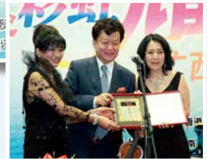
▲ 香港影視紅人關之琳小姐亦親臨支持，令晚宴生色不少。 Hong Kong movie star Miss Rosamund Kwan attended to show her full support, which made the event stunning.