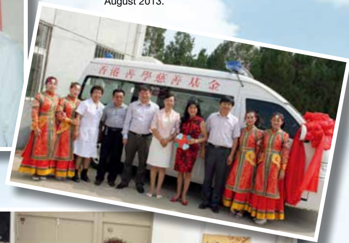
▼ 2013年8月——在內蒙古興安盟科右中旗濟困人民醫院舉行捐贈救護車儀式 The Donation ceremony of an ambulance to Inner Mongolia Branch Fing'an poor people's hospital, in August 2013.