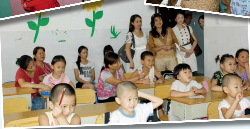
▲ 2010年8月——除照顧弱視小朋友外，還到南寧市孤殘兒童特殊教育院校探訪。 In addition to taking care of children suffered from amblyopia, we also visited the special school for the abandoned and disabled children in Nanning in August 2010