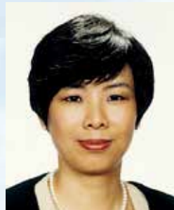
陳美蘭法官 HH Judge Mimmie Chan