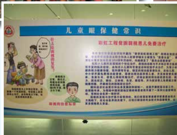
▲ 2011年8月——海口市弱视启动仪式 Inauguration Ceremony of Sheen Hok Amblyopia Project Haikou, August 2011