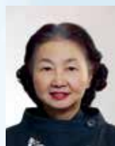
梁愛詩博士 GBM 太平紳士 Dr. Elsie Leung Oi-sie , GBM, JP